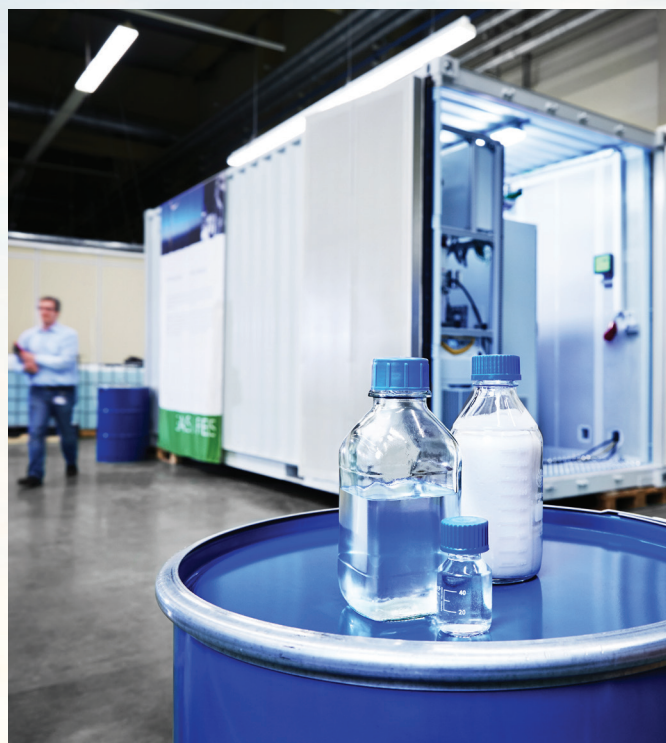
INERATEC / Hauser kerosene plant

By avoiding CO 2 of fossil origin the climate objective of fossil CO 2 emission reduction is met. Because the sustainable kerosene emits no soot (no aromatics) and no sulphur, it also meets future aviation air pollution standards.